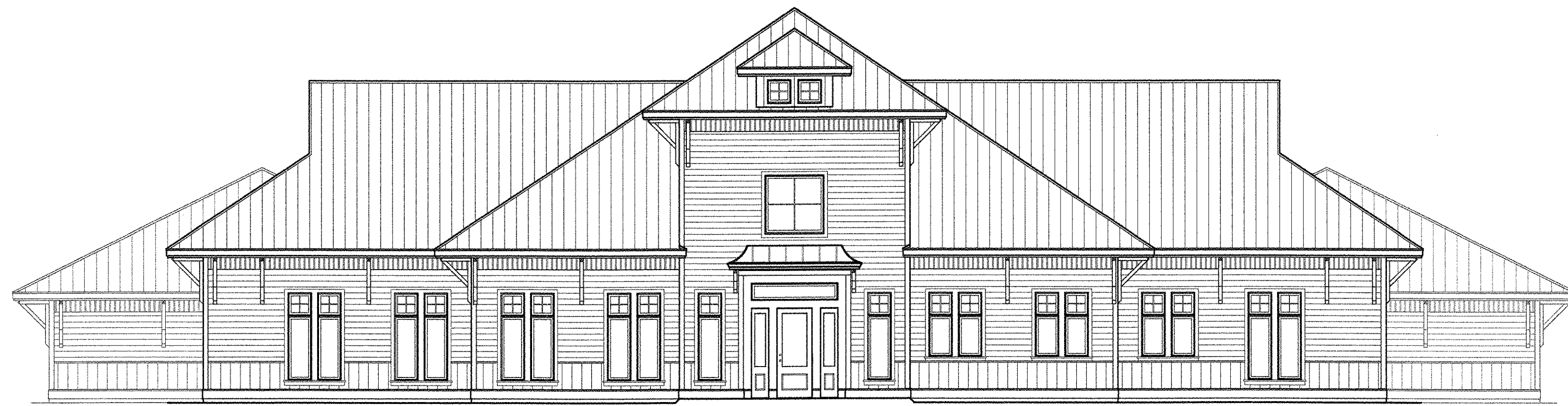
1 PROPOSED FRONT ELEVATION A2.0 SCALE: 1/8" = 1'-0"