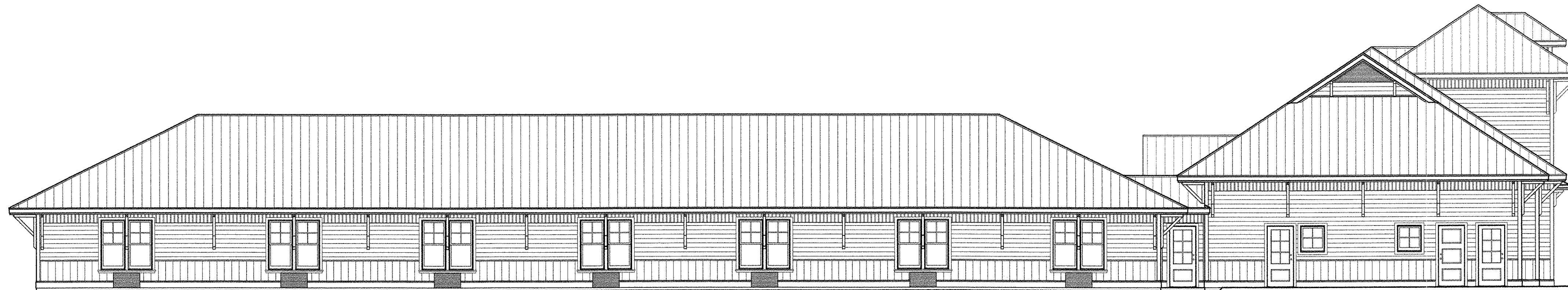
3 PROPOSED LEFT ELEVATION A2.0 SCALE: 1/8" = 1'-0"